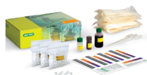
FB2502 Photosynthesis and Cellular Respiration Kit for General Biology