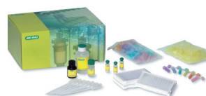
FB2572 ELISA Immuno Explorer Kit

Flinn is the only authorized US distributor of Bio-Rad Explorer