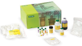
FB2570 PV92 PCR Informatics Kit

Ask Your Rep Or Visit https://www.flinnsci.com/Bio-Rad-Explorer-Life-Science For More Information.