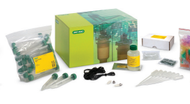
FB2571 Genes in a Bottle Kit