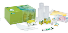
FB2565 pGLO™ Bacterial Transformation