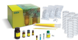
FB2579 Out of the Blue CRISPR Kit and Genotyping Extension